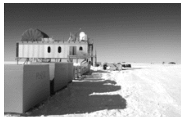
Taking out the trash. The line of cardboard boxes on the left are for sorting trash. All garbage has to be shipped back to Washington state in order to protect the

The dome also has facilities for the staff members who spend the winter at the South Pole in order to operate the telescopes and maintain the equipment. Most people come only for the summer, which runs from early November to mid-February. Outside that period, it's too cold for aircraft to land. Summer temperatures are