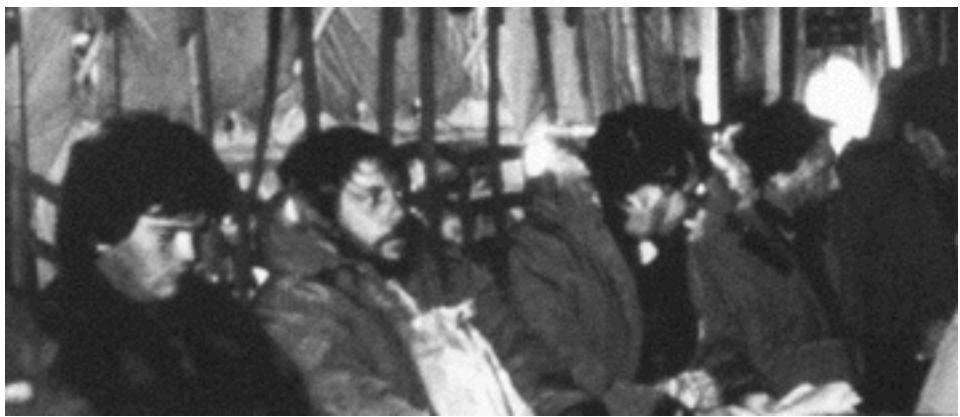
No frequent flyer miles, no in-flight entertainment, no free drinks. A U.S. Navy LC-130 Hercules transport plane gives new meaning to the term "bare-bones." Passengers going to Antarctica sit in the cargo hold and think about Tahiti.

Astronomers have a reputation for going to far-off places to watch the stars, but even their endurance is tested at the South Pole. On a nice warm summer's day, it might get up to -7 degrees Fahrenheit (-20 degrees Celsius). Refrigerators have to be heated, rather than cooled, to preserve food. The nearest major city is 11 hours away by military transport planes, which make economy-class airliners look like flying palaces: Passengers sit in nets amid boxes of cargo, wearing earplugs the whole way.