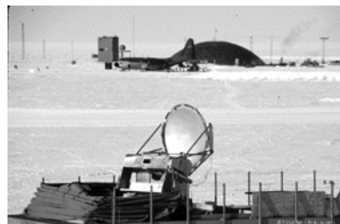
Welcome to the Dark Sector. The South Pole observatories are located about 800 meters (half a mile) from the main station, on the other side of the airplane runway. The mirror is for the AST/RO submillimeter telescope, which, appropriately, probes the cold gas in interstellar

Only in this decade, however, have researchers made a concerted effort to build observatories at the South Pole. Two groups have led the way: the Center for Astrophysical Research in Antarctica (CARA), which includes scientists from various institutions in the United States and Australia, and the