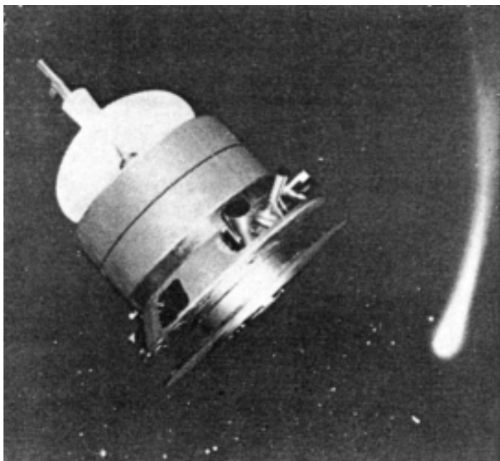
The European Space Agency's Giotto spacecraft (above) will, if all goes well, come within 500 km of Comet Halley's nucleus on March 14, 1986.

Halley's Comet passes closest to the Earth on its outbound journey (and the closest it comes during this passage). Comet will be 63 million km (39 million mi) from us. [Its closest known approach was 3 million mi on Apr. 10, 837 A.D.]