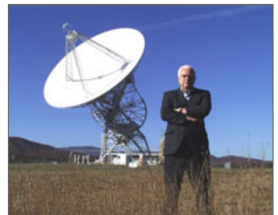
Drake standing in front of the telescope he used to conduct the first modern search in 1960 (he called it Project Ozma).

2011 marks the 50th anniversary, not of the search, but of a pivotal meeting and the creation of an equation that has done much to guide us in our quest to find life in the cosmos. In 1961, Drake called