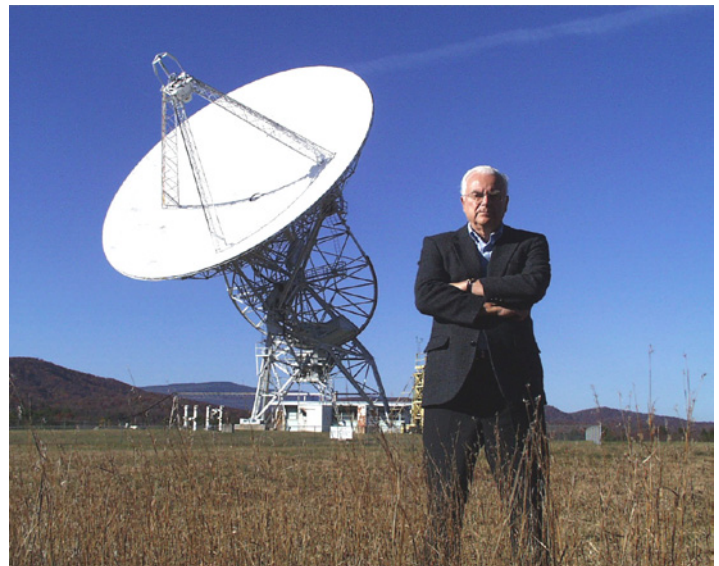
Drake standing in front of the telescope he used to conduct the first modern search in 1960 (he called it project Ozma).

2011 marks the 50 th anniversary, not of the search, but of a pivotal meeting and the creation of an equation that has done much to guide us in our quest to find life in the cosmos. In 1961, Drake called a meeting of the minds in