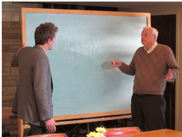
Frank Drake explaining his equation to BBC program host Dallas Campbell in the NRAO Green Bank Residence Hall Lounge.

Taking the current numbers (or the average of the estimates) and multiplying them, we get N=(1)(0.4)(1)(0.5)(0.5)(0.5)(10,000) —Drake's L thrown in for good measure—or N=500 communicating civilizations in the galaxy.