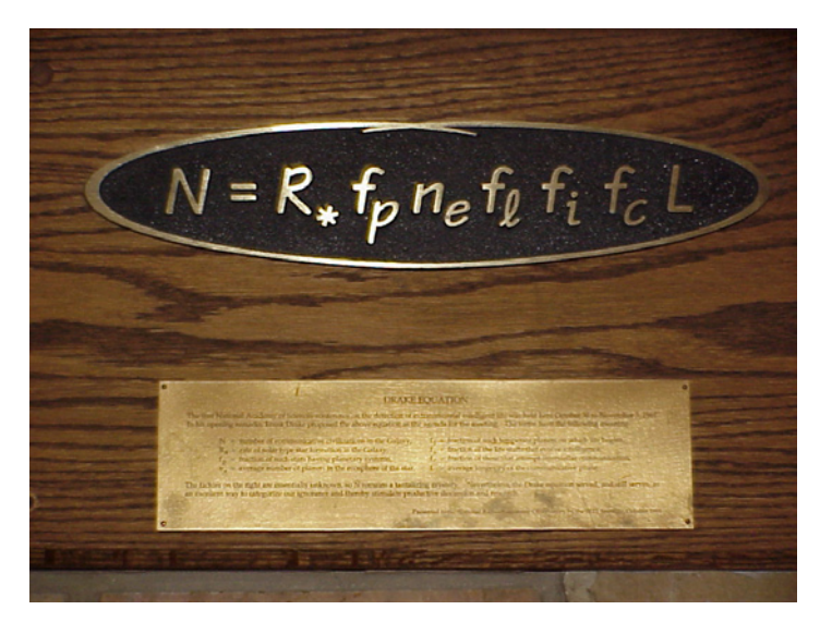
Drake Equation Plaque on Wall of Conference Room at Green Bank (Paul Shuch)

When the meeting took place, starting November 1,