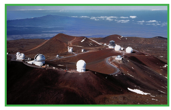
The Gemini telescope has a very large mirror, over 26 ft. in diameter, and it is located at an altitude of 4200 meters (close to 14,000 feet) at Mauna Kea, Hawaii.

dim galaxies from the bright background light in the sky. For this reason, research telescopes are located far from cities under very dark skies. But it's not just lights that keep us from getting a good view, it's also our air! You've heard the childhood rhyme, "Twinkle, Twinkle, Little Star. " It's the air in the Earth's atmosphere that makes the starlight twinkle, so the less of it that we have between our telescope and the star, the better. Astronomers put their telescopes up on a mountain where there's less of the atmosphere above them, and even out in space where there's no air to distort the light.