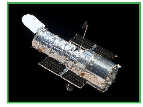
The Hubble Space Telescope orbits the Earth, outside the distortion of the atmosphere, allowing it to take very high resolution images of distant astronomical objects. Its mirror is about 8 ft. in diameter.

Telescopes and binoculars are a great beginning to give our eyes a better view of the heavens, but astronomers don't stop there. Astronomers use different kinds of instruments on their telescopes to measure how bright the starlight is and even break it up into a rainbow of colors so they can figure out how hot a star is, what it's made of, how fast it's moving, and how far away it is.