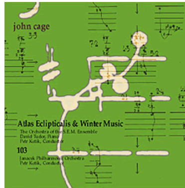
Cage: Atlas Eclipticalis