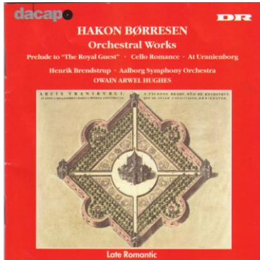
Borresen: At Uranienborg